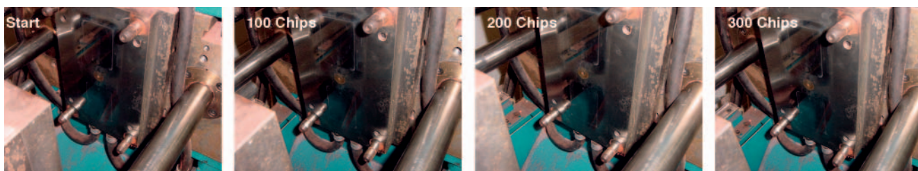
Fig. 2. No plate-out during the RadGlo test of the RPC Series: 2 % in 5 kg PE-HD (300 chips)