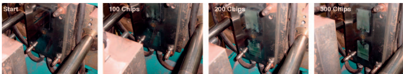
Fig. 1. Plate-out on the mould surface when injection moulding with the RadGlo EA Series: 2 % in 5 kg PE-HD (300 chips)

coloured with 1 % RadGlo EA10 showed a 15 % reduction in stability with respect to maximum reflection between 220 and 280°C, while similar chips coloured with 1 % RadGlo RPC10 exhibited stable maximum reflection.