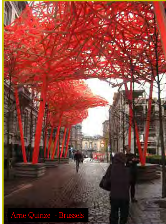
Arne Quinze - Brussels

For indoor applications or short life outdoor paints, such as decorative, temporary markers and artist paints, RADGLO® PS colours may be chosen.